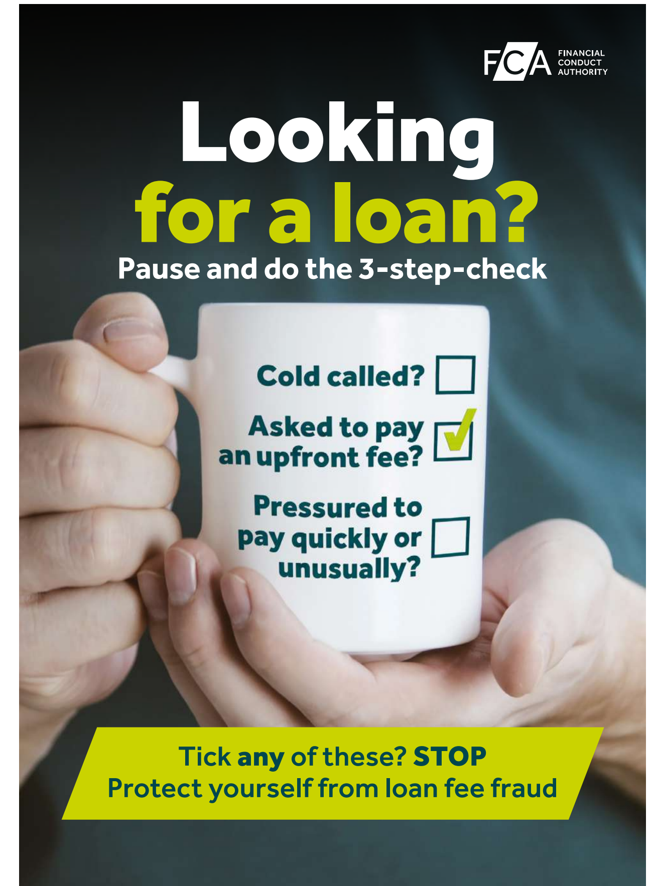
A4 Poster (210x297)