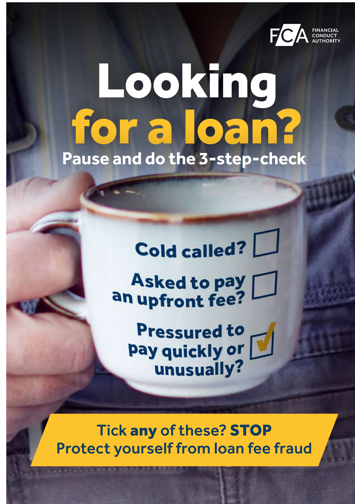
A4 Poster (210x297)

Here is an A4 poster that you can use. Put it up in your offices or on your webpage to spread awareness of loan fee fraud.