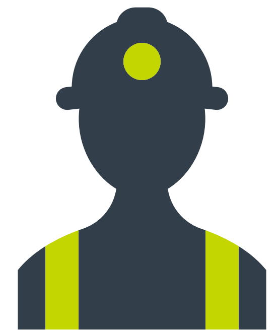
Working in manual occupations or unemployed