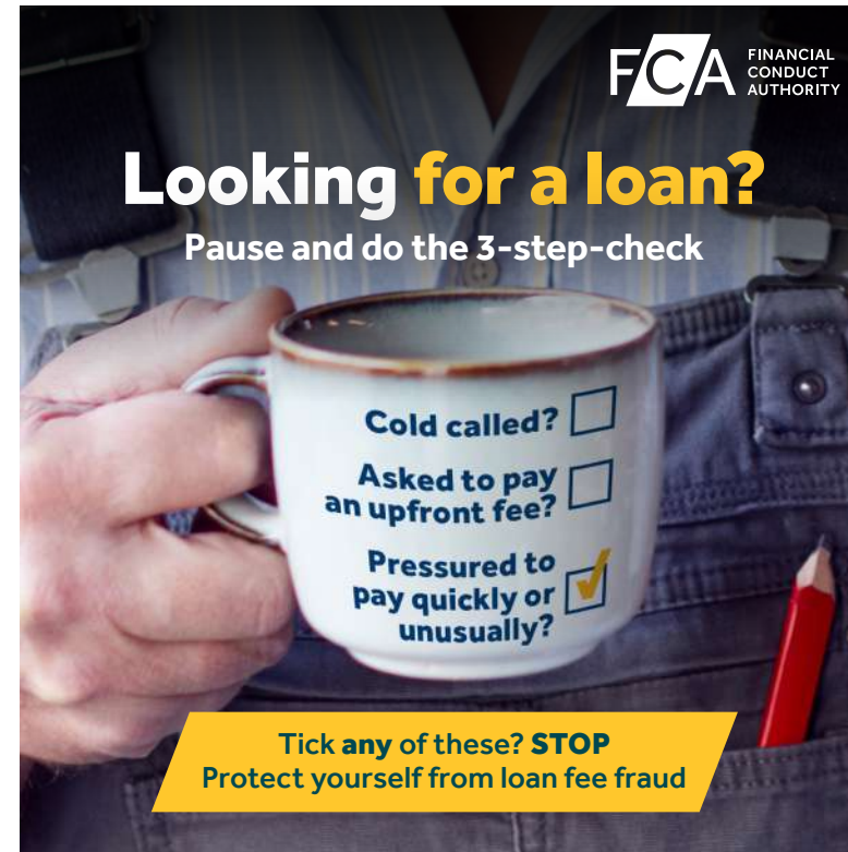
Facebook or Instagram (1080 x 1080px)

The images are available in Twitter (1200 x 675px) and Facebook or Instagram (1080 x1080px) sizes, and also as a 5-part social media carousel.