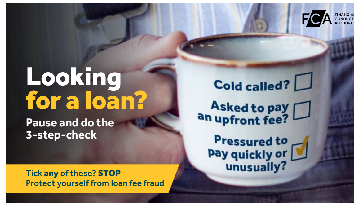
Twitter (1200 x 675px)