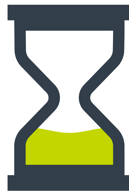
Aged 25-45 (average age of 37)