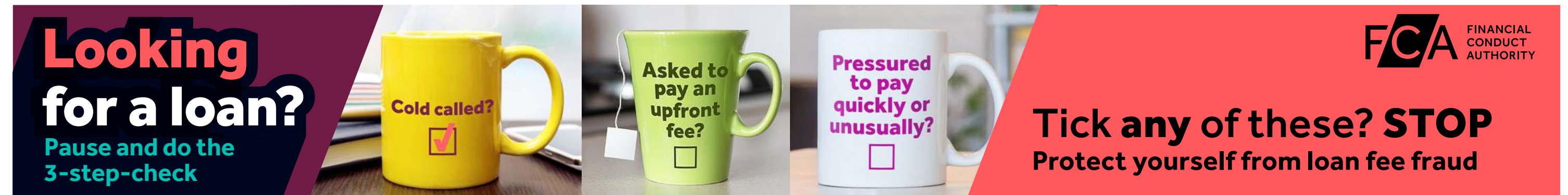
Leaderboard (728 x 90)

Here are some web banners you can use. Use them on your webpages or in your email signature to spread awareness of loan fee fraud.