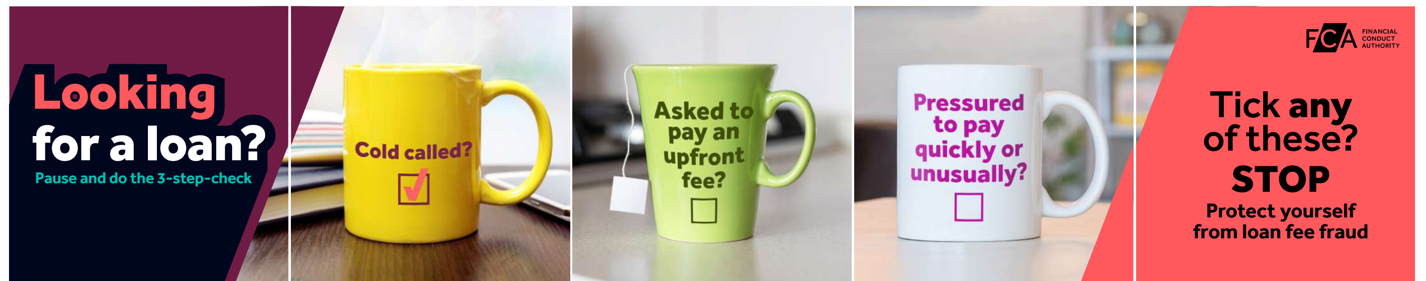
Instagram carousel (1080 x 1080px)